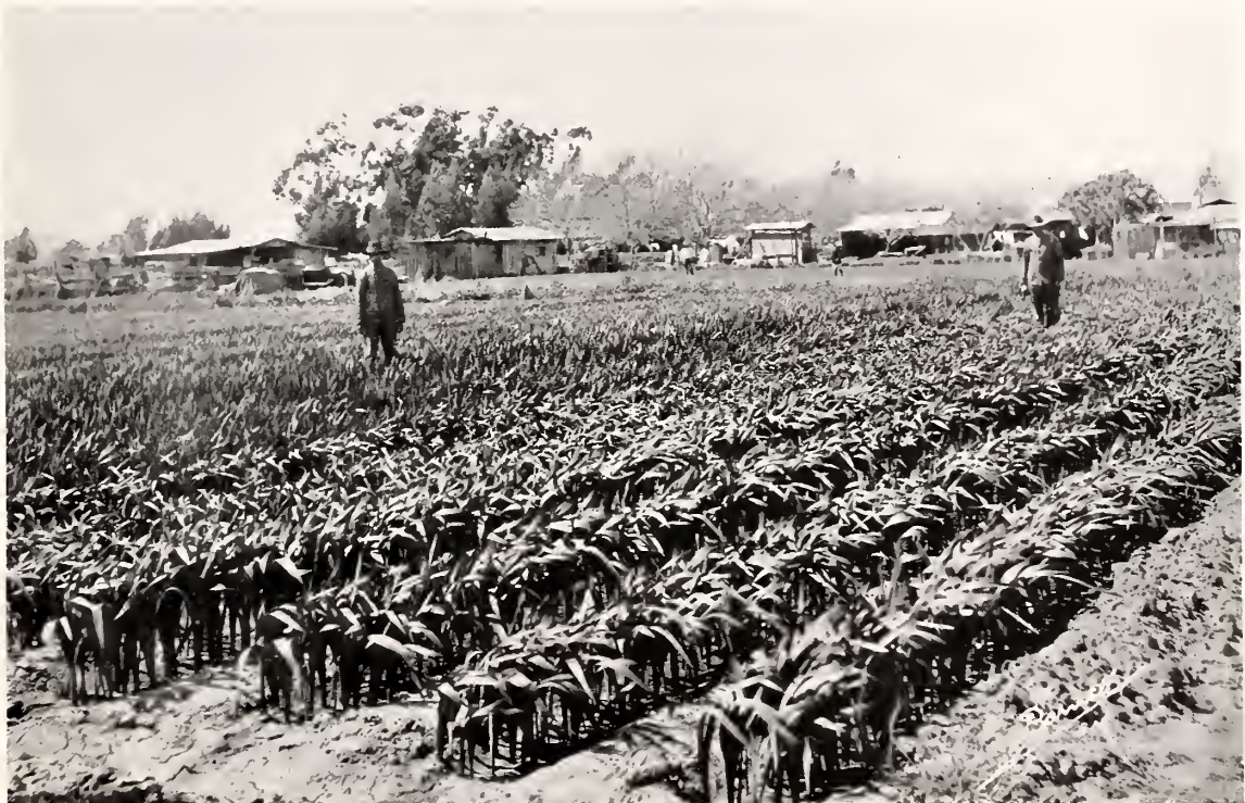
Portion of our Gladiolus fields.